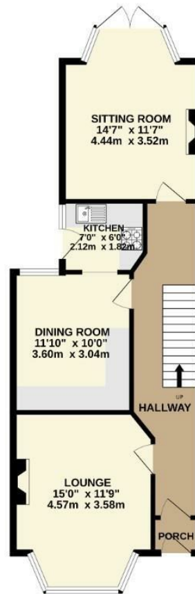
GROUND FLOOR 611 sq.ft. (56.8 sq.m.) approx.